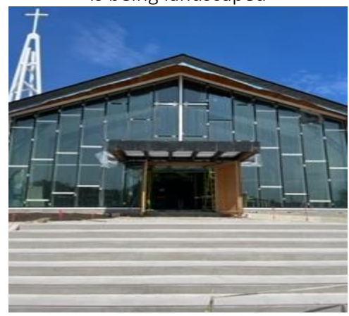
Next week the cement will be poured on the sidewalks and entrance ramps