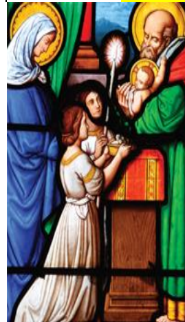
The Presentation at the Temple WORLD DAY FOR CONSECRATED LIFE

In 1997, Pope Saint John Paul II instituted a day of prayer for women and men in consecrated life. This celebration is attached to the Feast of the Presentation of the Lord. This Feast is also known as Candlemas Day ; the day on which candles are blessed symbolizing Christ who is the light of the world. (Bring your candles to be blessed) So