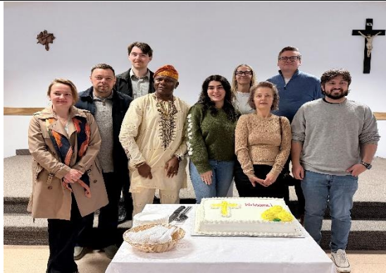
We welcomed and celebrated our newest members in our Catholic Faith Community over Coffee & Cake.

Spend a night with Jesus in the Blessed Sacrament every First Friday of the month following the 7 p.m. Friday mass. The Sacrament of Reconciliation is available before Exposition. The evening consists of Adoration of the Blessed Sacrament, personal quiet contemplation, hymns of praise and worship, and the Rosary of the Father. The First Saturday Mass begins at 8:30 a.m. Worshippers are free to join at any point throughout the night and can stay as long as they like. Access to the church is through the breezeway (doors between the Church and Parish Hall).